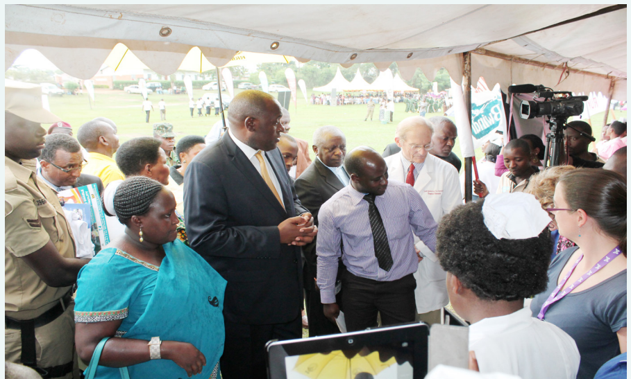
BCH team showcasing the hospital services to the Minister of Health, Hon. Chris Baryomunsi