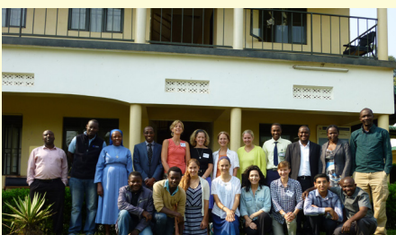
ITW with UNSB management after a support supervision visit.

The Ultra sound training program for nurses at UNSB is moving on well since it was launched last year. The extra course which is being implementing in partnership with University of Vermont, USA, through Imaging the World Africa (ITW-A). The