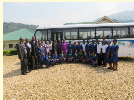
Board of governors, students and some of the staff posing in front of the school bus

We are forever grateful to benefactors for the Immeasurable support!