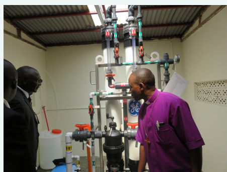
Some of the BCH board members inspecting the water system

We are so grateful for this life changing system from the GE Foundation through ASSIST International.