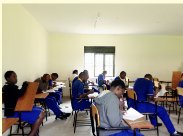
Students doing examinations last year

success rate in the National Promotional Examinations since we started. To move to the next class, nursing students all over the country are subjected to a national promotional examination at the end of each year of study. Last year, we had two groups sit for these exams and all of them passed.